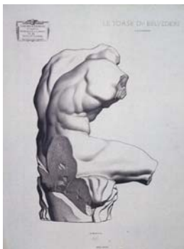
Belvedere Torso Lithograph for the Cours de Dessin, ca. 1868 23 1/2 x 18 1/2 inches Musée Goupil, Bordeaux, France