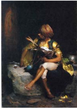
Bashi-Bazouk, 1875 Oil on canvas 18 1/4 x 13 inches Metropolitan Museum of Art, NY