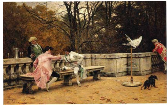
The Chess Players, 1882 Oil on panel 11 1/4 x 17 1/4 inches Private Collection