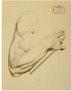
Arm of Moses, after Michelangelo Lithograph for the Cours de Dessin, ca. 1868 23 1/2 x 18 1/2 inches Dahesh Museum of Art 2001.10