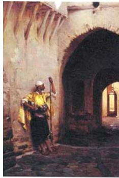
The Sentinel. The Guardian, 1873 Oil on panel 13 3/4 x 9 3/4 inches Private Collection