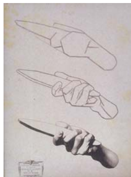
Hand with Whetstone Lithograph for the Cours de Dessin, ca. 1868 23 1/2 x 18 1/2 inches Musée Goupil, Bordeaux, France