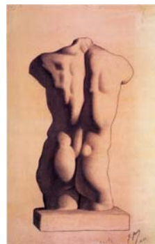
Pablo Ruiz Picasso Study of a Torso after a Plaster Cast, 1893-94 ; Charcoal on paper, 9 1/4 x 12 3/8 cm) # Z. VI:I; Musée Picasso, Paris