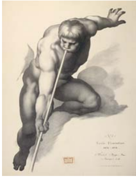
Angel Blowing a Trumpet, after Michelangelo Lithograph for the Cours de Dessin, ca. 1870 23 1/2 x 18 1/2 inches Dahesh Museum of Art 2001.17