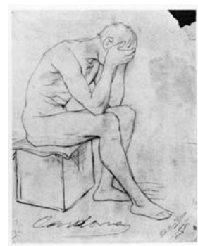
Pablo Ruiz Picasso Seated Male Nude, 1892-93 Conté pencil, 51.8 x 36.5 cm The Picasso Estate. Z. VI:13 ©2004 Estate of Pablo Picasso/Artists Rights Society (ARS), New York

All images by Charles Bargue, unless otherwise indicated.